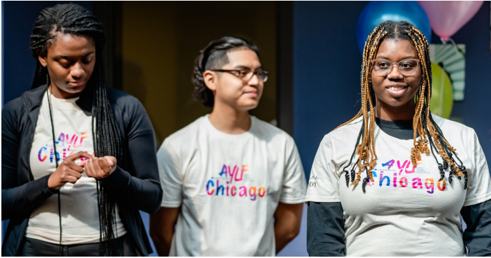
Fellows present their Community Impact Project, Chicago, May 2024.

In 2023-24, Aspen Young Leaders Fellowship (AYLF) continued to foster its belief in the power of young people as changemakers. By partnering with Fellows and their communities to develop their understanding of self and take action on ideas for social solutions, AYLF planted the seeds for Fellows to thrive as leaders and steward positive impact.