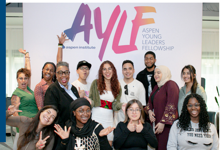
Program Facilitators and Fellows at Graduation, Chicago, June 2024