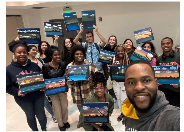
Fellows in seminar making art, Miami, February 2024.

As we brought closure to AYLF with graduation, we looked at how the Fellowship contributes to the collective effort of building meaning and envisioned futures with continued AYLF opportunities and expanded community.