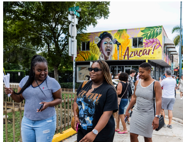
Community Tour, Miami, September 2023.

Evolving their understanding of critical leadership, Fellows begin to ideate on their CIP. This session was a multi-day retreat with Fellows traveling to the Key West, Little Rock, and Lake Geneva.