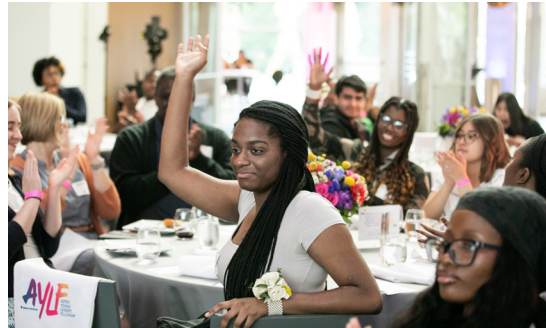
Chicago Dreams event, August 2023.

AYLF kicked off the program by bringing together Fellows and community stakeholders for dinner and conversation about what it means to make dreams possible.